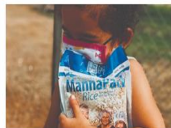
A Year of Faithfulness >