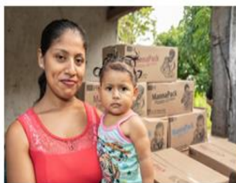
A Hope and a Future >