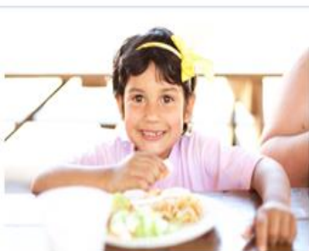
Praying His Promise >